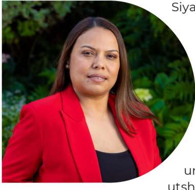
Siyanamukela kuNcwadindaba yethu Yokuqala Yamalungu yangowezi-2023!

Ongoti kwezomhlalaphansi bavame ukutusa ukuba umuntu abeke imali eningi ngangokunokwenzeka phakathi neminyaka yakhe yokusebenza ukuze alangazelele umhlalaphansi onokunethezeka. Kodwa njengoba isimo sezomnotho saseNingizimu Afrika sinzima (angiyiphathi-ke eyengcindezi elethwa ukulokhu kucinywa ugesi!), siyazi ukuthi ukubekelela umhlalaphansi wakho kulukhuni kakhulu. Zibonge kakhulu njalo ngenyanga lapho ubekelela umhlalaphansi wakho, wazi ukuthi lesi isinyathelo sokuqinisekisa ukuthi unekusasa elihle.