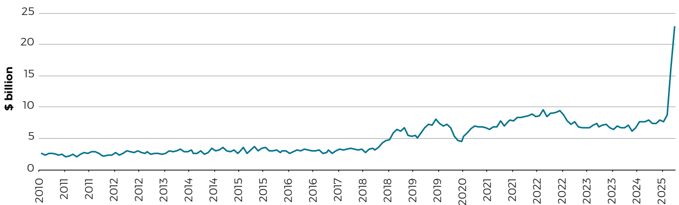
CHART 2: US TAX RECEIPTS FROM CUSTOMS DUTIES

tariffs will expire. It is unlikely to be the end of the matter completely, and new threats and deadlines are likely to emerge from time to time. The uncertainty is not helpful, but the effective tariff US rate (the average across all categories and countries) will probably eventually end up somewhere between 10% and 15%, much higher than the 2.5% at the start of the year, but not quite as bad as feared in April.