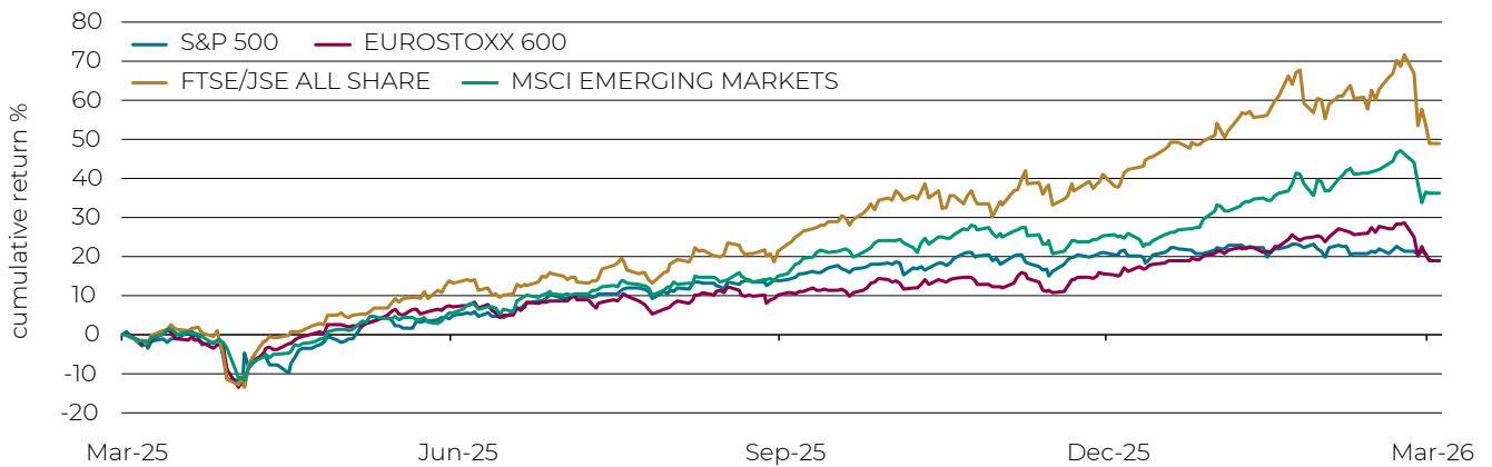
CHART 3: GLOBAL EQUITY MARKETS OVER 12 MONTHS IN DOLLARS